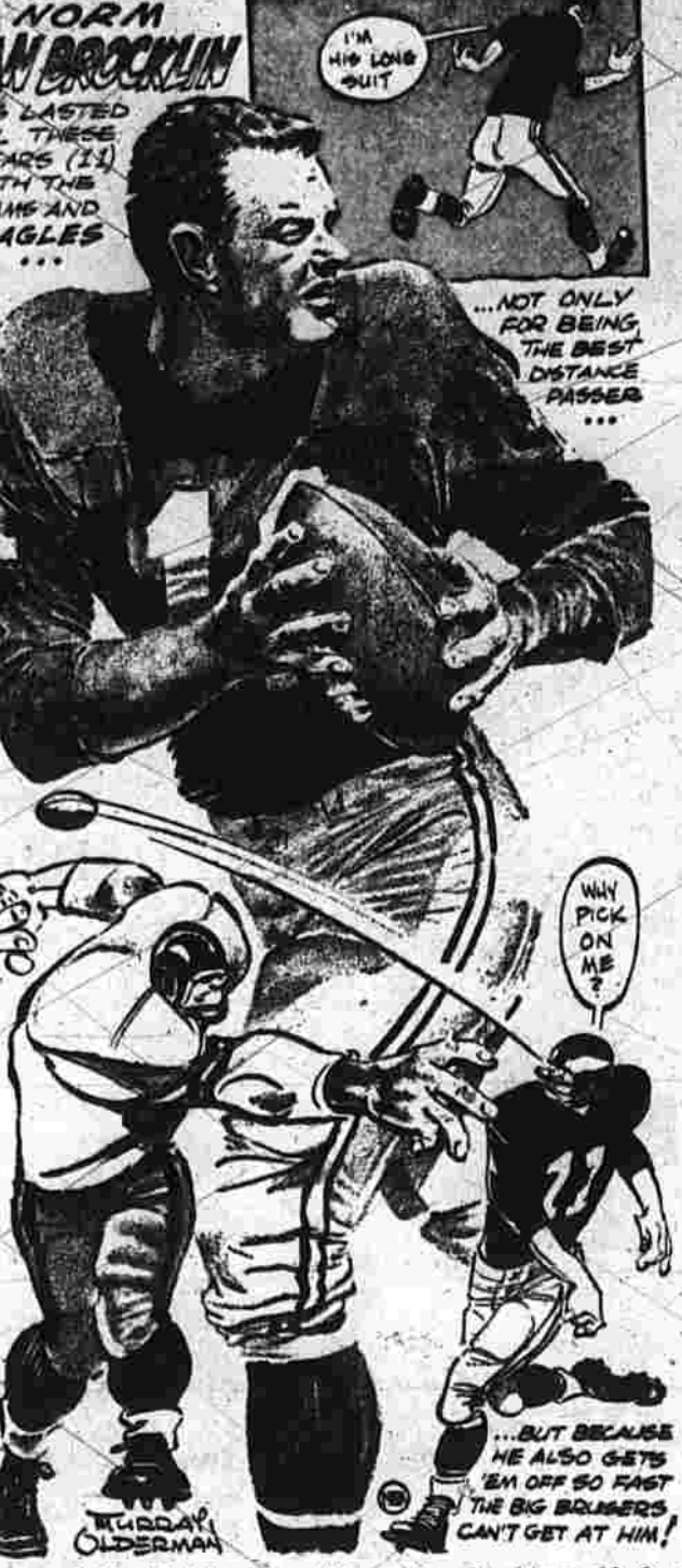
Van Brocklin runs with the football during a game for the Los Angeles Rams.