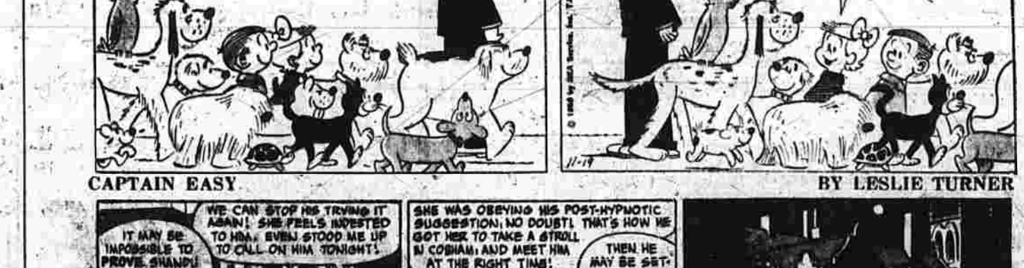
MORTY MEEH BY JOHNNY HART