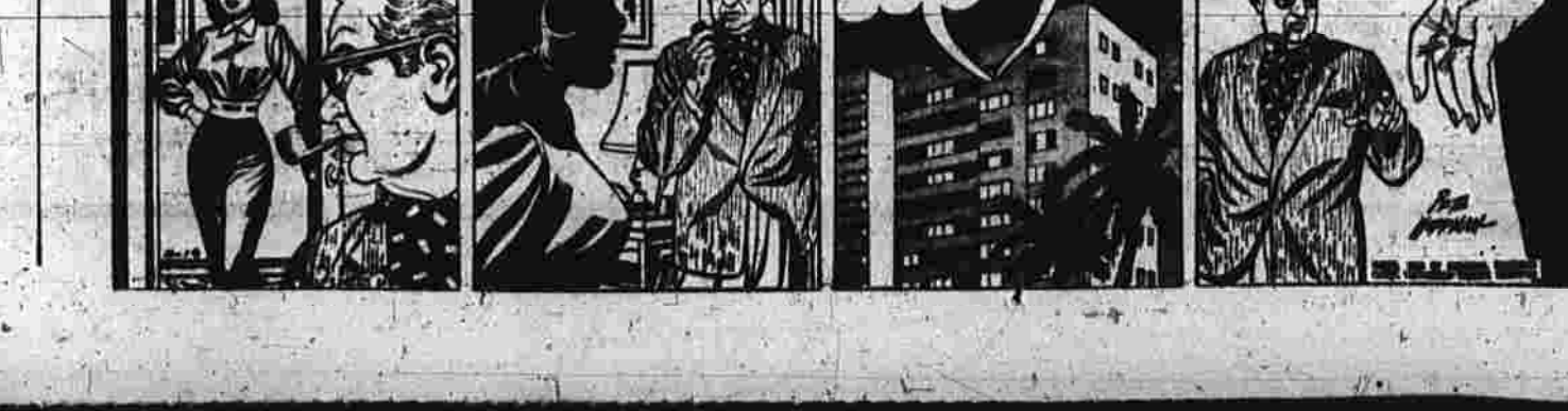
MORTY MEEH BY JOHNNY HART