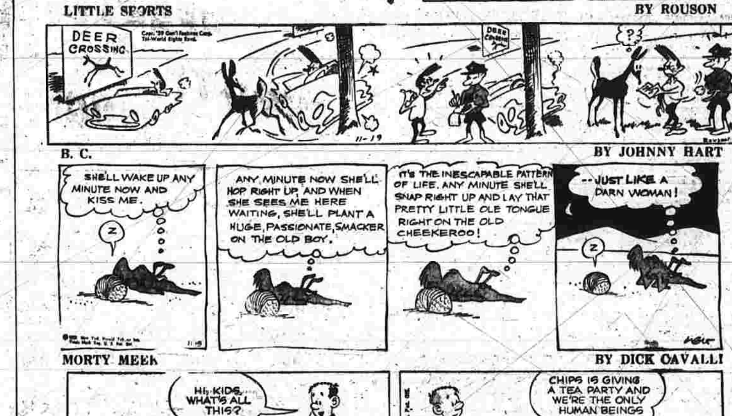
LITTLE SPORTS BY ROUSON