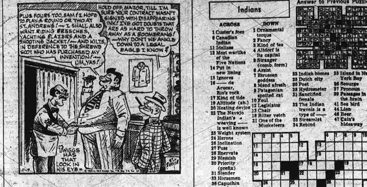
OUR BOARDING HOUSE with MAJOR HOOPLE BY DICK TURNER